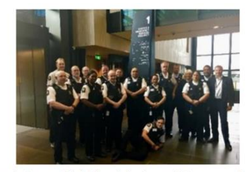
Court Security team at Christchurch Justice and Emergency Services Precinct

witnesses may feel pressured to tell their stories in particular ways and observers may question the integrity of the court process. These, in turn, have the potential to undermine the community's confidence in the criminal justice system as a whole.